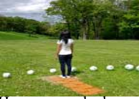
Human sun clock