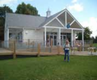
New Cafe/Community facility