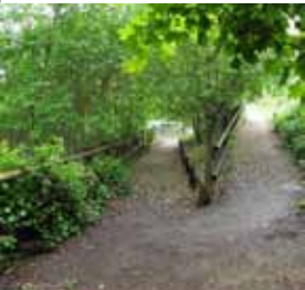
Ramped paths for improved access to top of park and 'view points'