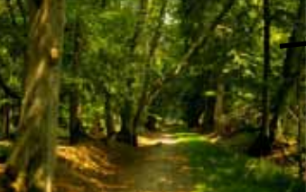
New woodland paths in orchard for pedestrians and bikes