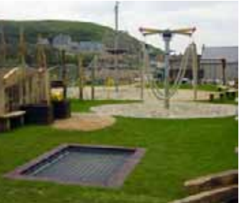
Refurbished children's play area with natural play features