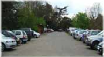
New extended car park to accommodate more cars and visitors to the Park

The overall aim is to incorporate the orchard as part of the park and create recreation opportunities in the form of pathways, possible bmx track and cycling tracks. In the existing park all the pathways need to be refurbished and new ramped links created to link the top and bottom tiers. The play area needs refurbishment, the car park needs extending and a permanent sunclock on the old gun emplacement.